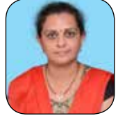
Jr. Typist Clerk