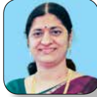
P. A. to Director