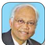
Dr. R. A. Mashelkar FRS, FNA, FTWAS Chancellor

CSIR Bhatnagar Fellow and President Global Research Alliance Former Director General CSIR and Secretary, DSIR, GOI Padmavibhushan Awardee