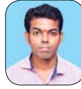
Jr. Typist Clerk