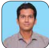
Sr. Accounts Clerk