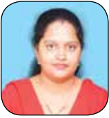
Jr. Typist Clerk