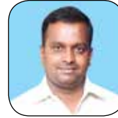
Jr. Typist Clerk