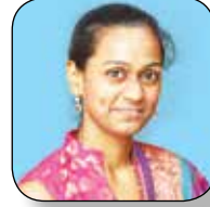
Jr. Typist cum Clerk