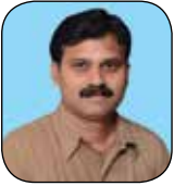
Jr. Typist Clerk