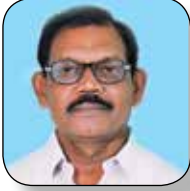
Officer on Special Duty