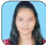
Jr. Typist Clerk