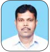
Ag. Store Superintendent (From 02/01/15)