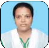
Sr. Accounts Clerk